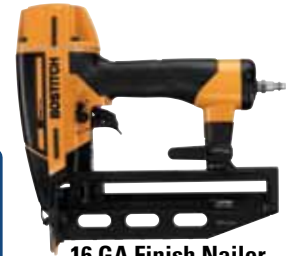
16 GA Finish Nailer BTFP71917